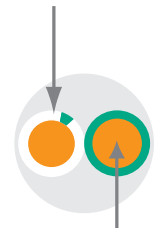
23 AWG Bare Copper