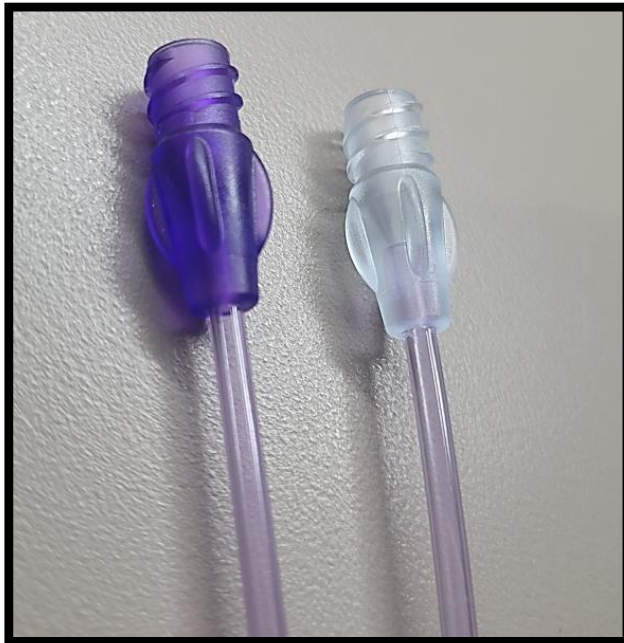
Luer and tube are solvent bonded together