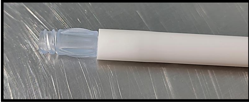
Pressfit luer into tube ID (no adhesive used)