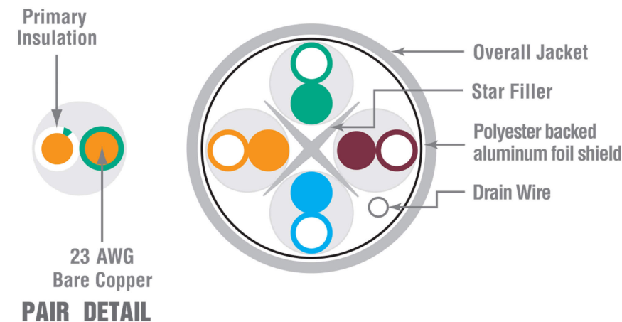
23 AWG Bare Copper PAIR DETAIL